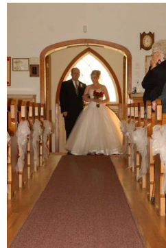
View looking from the front to the back of the church centre aisle.