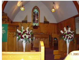
View of the front of the church with two of the floral arrangements.

Wendy Kennedy wendy_kennedy@sympatico.ca 905-728-5952